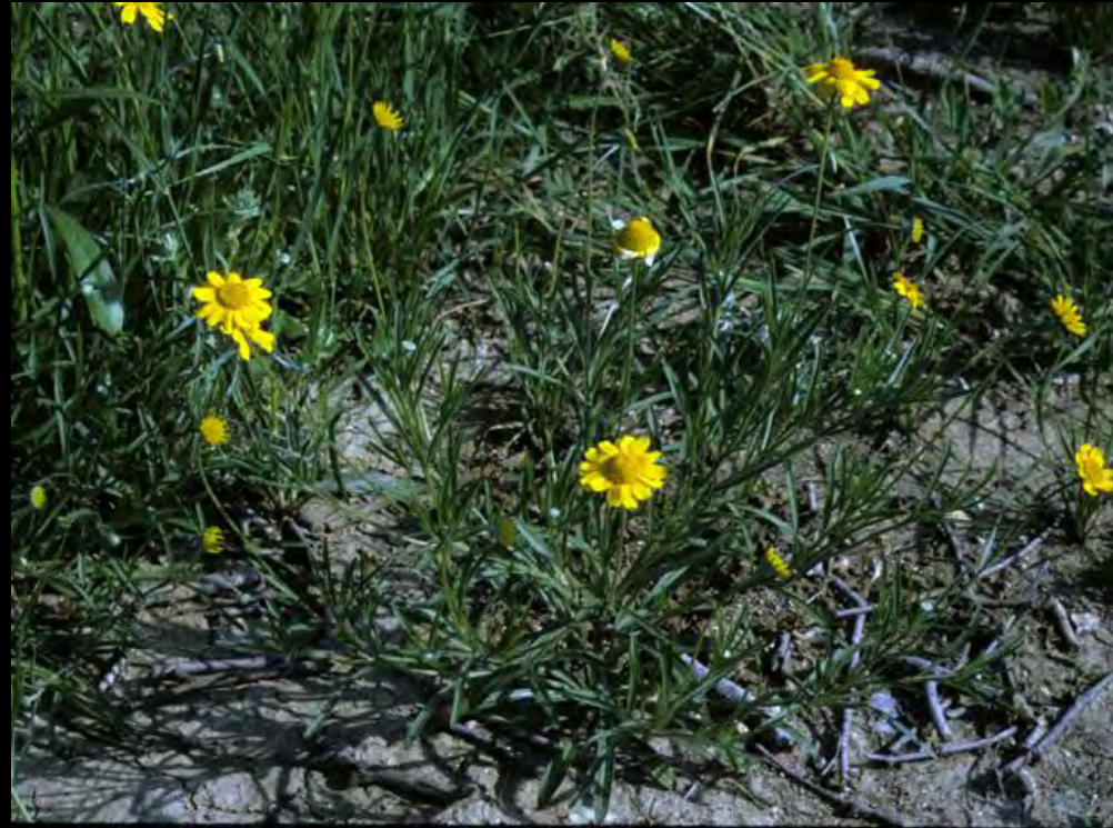
Four nerved daisy Tetraneuris linearifolia