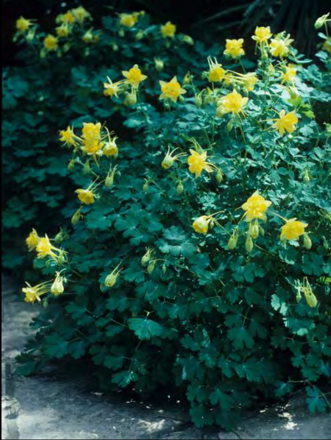
Columbine Aquilegia spp.