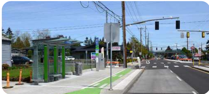
SE Division Street at 135th Avenue Bus Rapid Transit Station, Portland, OR

Shared cycle track stops allow for buses to make a stop without blocking the bike lane, while providing clear conflict delineation between cyclists and passengers boarding and alighting.