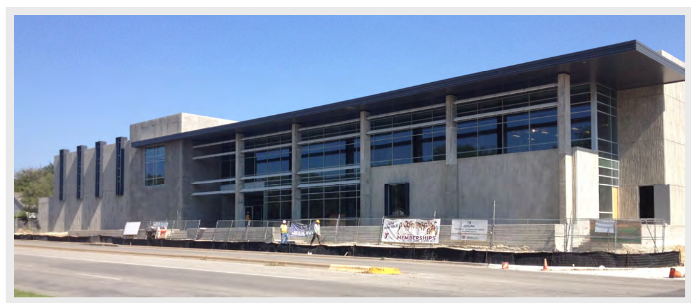
The new North Austin Community Recreation Center was built in partnership with the YMCA, and funded in part by funds from the 2006 Bond Program.