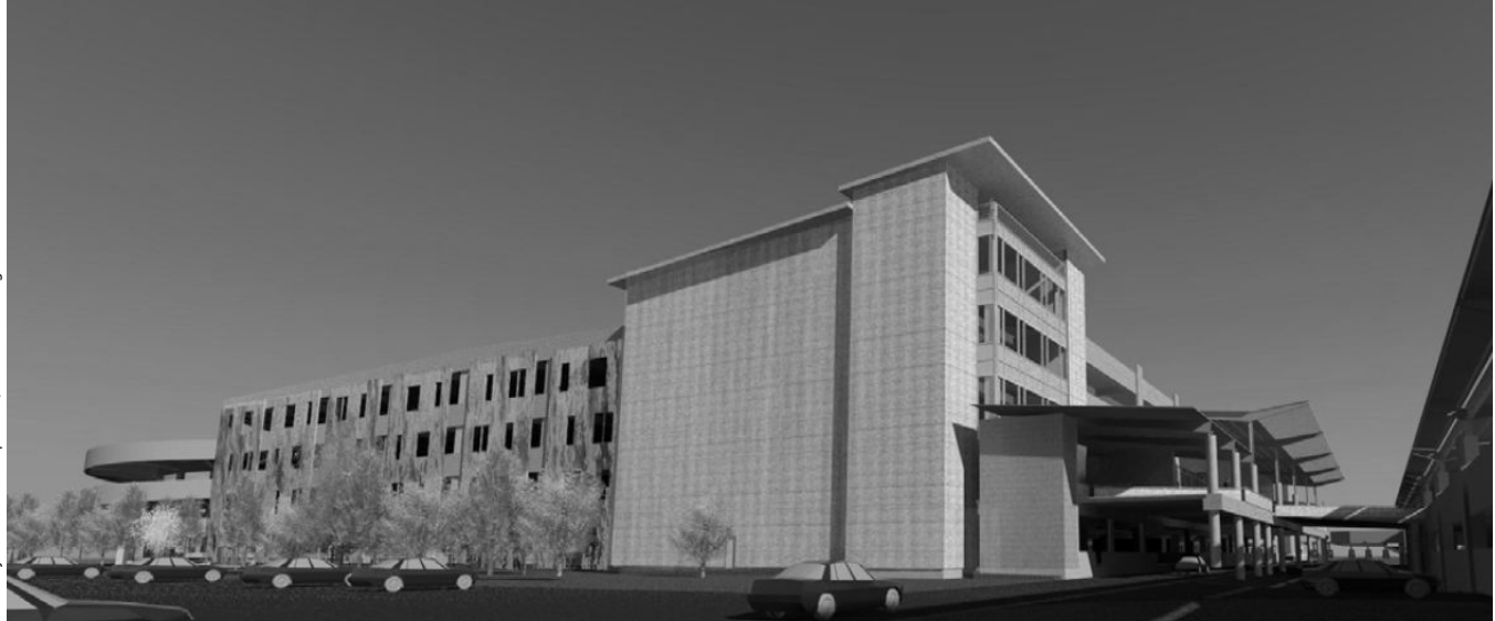
A rendering of a design for a new Consolidated Rental Car Facility, which will be built on the eastern half of Lot A at Austin-Bergstrom International Airport.