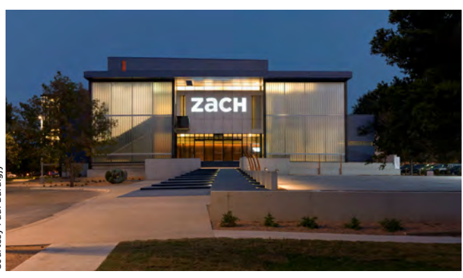
The ZACH Topfer Theatre was completed in October 2012.

Center: The center is nearly halfway through construction. Building structural concrete work was completed in August, and as of the end of September, underground utility construction was nearing completion. Structural steel erection is under way, and completion of the first phase of the facility is anticipated by summer 2013. The City contributed $5 million in seed funding to the center, which was approved by voters in 2006.