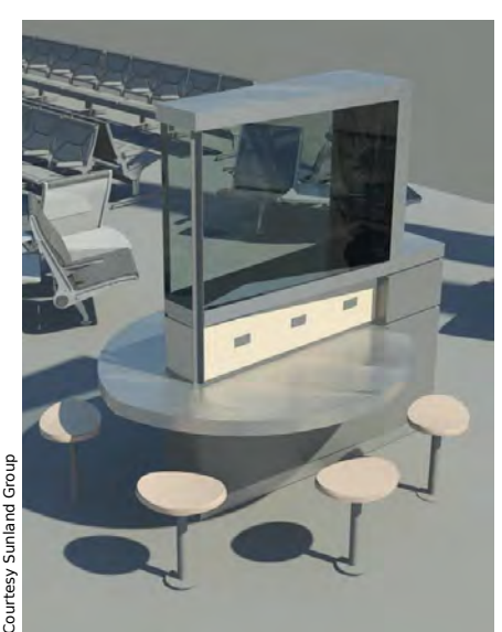
Terminal improvements include a new business center.

The infill project will be a multilevel addition to the east end of the terminal, including new checkpoint facilities, baggage handling, point facilities, baggage handling, support facilities, loading dock and shell space. The Design Criteria Manual has been completed a. Hensel-Phelps has been selected as the design-build firm, and design commenced in December 2012 with construction starting in fall 2013. The Aviation Department is pursuing FAA funding to augment the project budget.