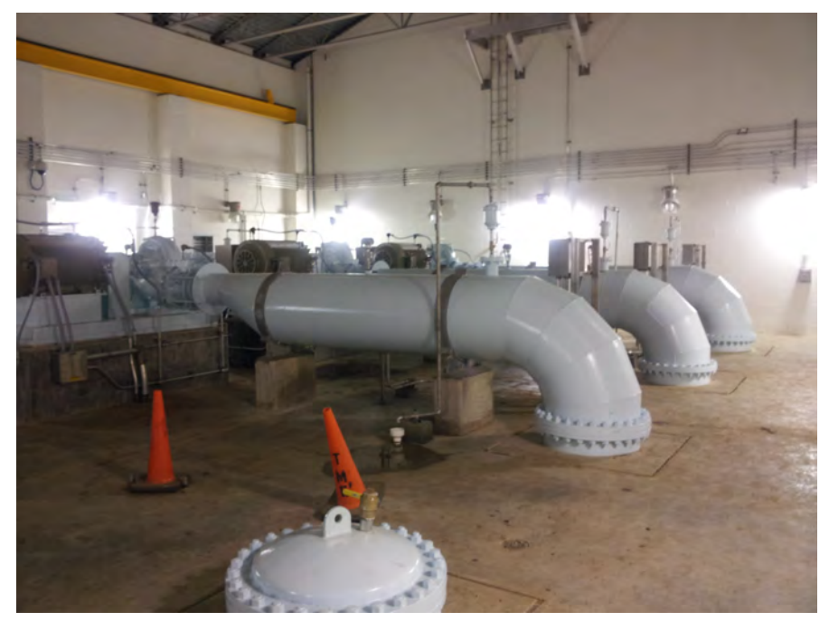
(Above) Motors and pumps in the Pilot Knob Pump Station used to deliver potable water. (Below) The Raw Water pump station at Water Treatment Plant 4.

Construction at the Raw Water Pump Station started in April 2012 with the placement of perimeter forms, vapor barrier and reinforcement for building slab. While work continues on the RW Pump submittals, five pump foundations have been formed with reinforcement and anchor bolts installed as well as concrete placed.