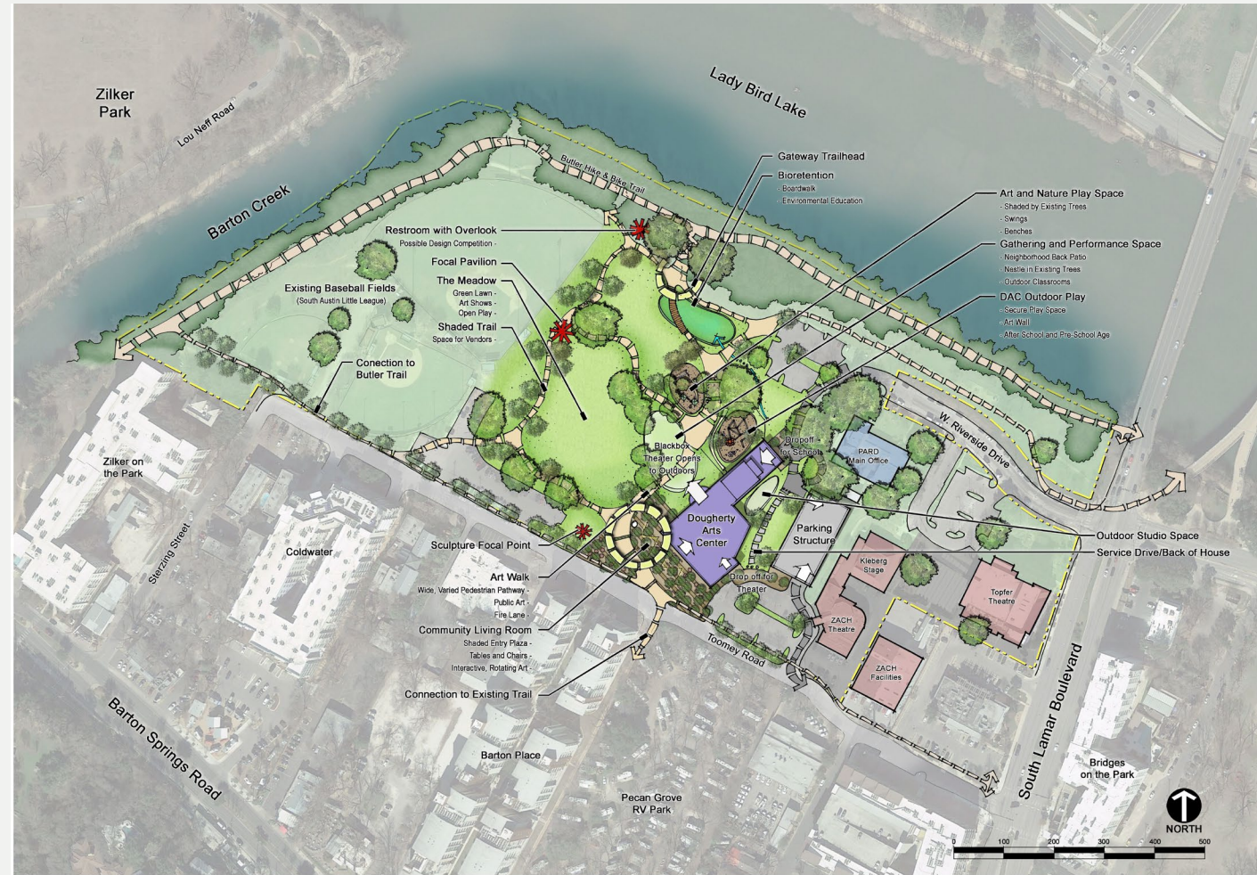
Conceptual Site Plan