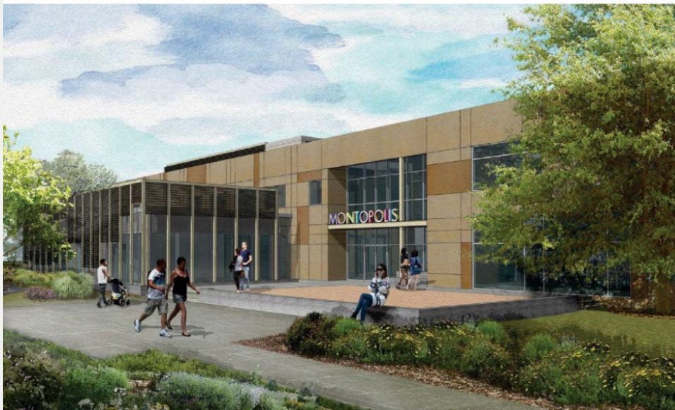
Montopolis Recreation Center