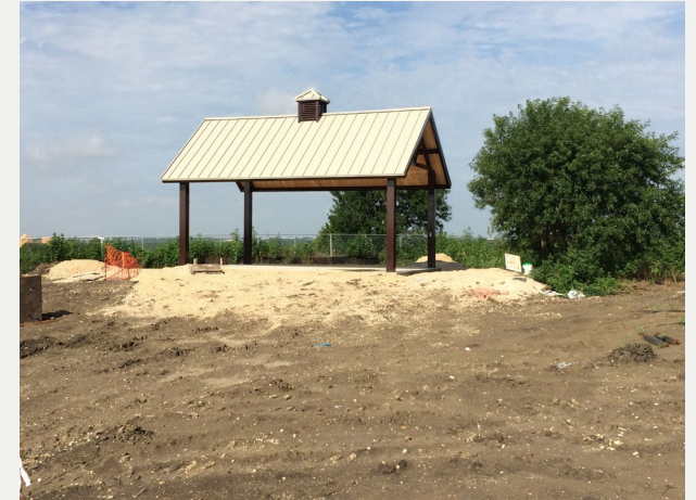
Colony Park Pavilion