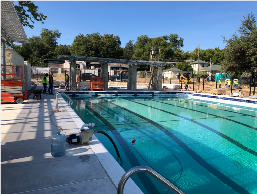
Shipe Neighborhood Pool