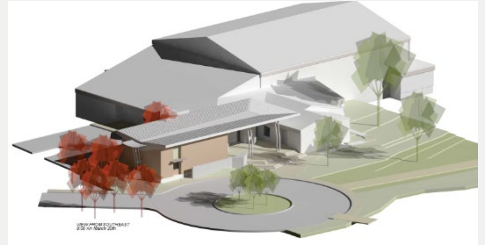
Dove Springs Recreation Center